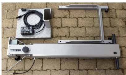
Simple disassembling to three major parts, for transporting and storage in small space.