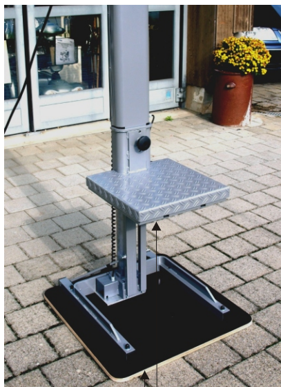
Groundplate (optional) for more stability onto bad or natural ground

Handy, dismountable, mobile and portable, ideal on the way and at home.