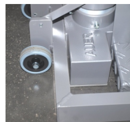
Robust technology for a long life time.