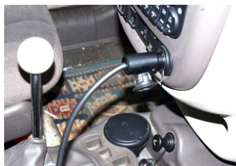
Connecting to 12V= car cigar lighter (optional inverter for 24V=)