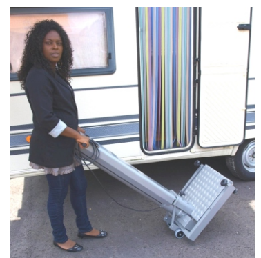
Easy handling thanks drive-rolls-set