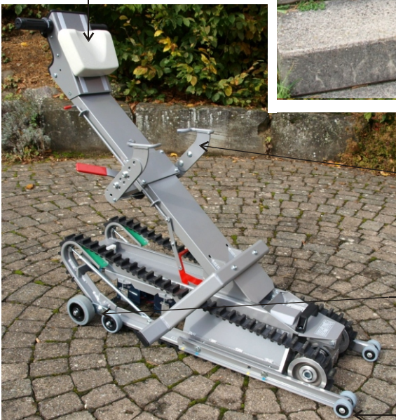
Wheelchair-fixation fourfold adjustable