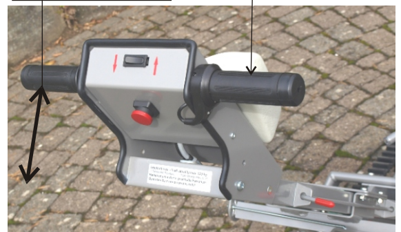
Throttle-handle speed control